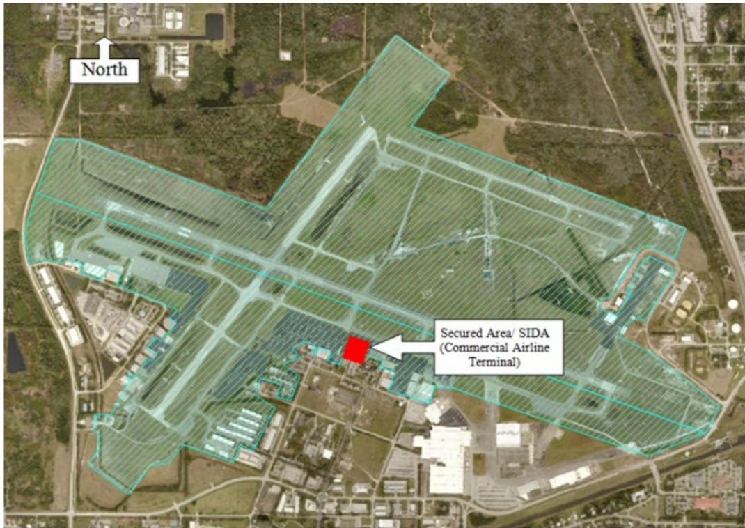
Layout shown with generalized perimeter locations for familiarization, not intended for navigation purposes.